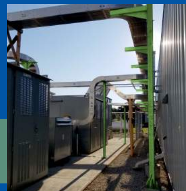
Disclaimer: Not actual colour. Green colour is used to highlight the supports