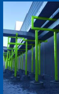
Disclaimer: Not actual colour. Green colour is used to highlight the supports